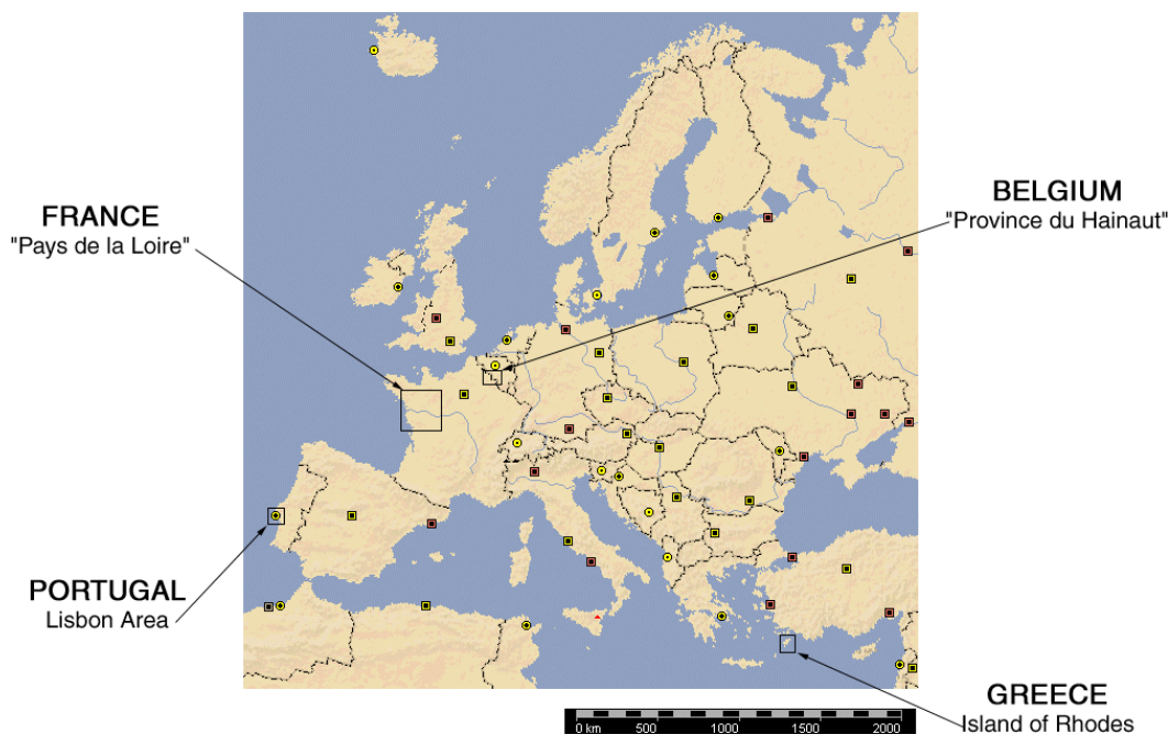
Figure 1: Location of the four national networks of schools involved in the ModellingSpace project – Map of Europe

The MS project partners have all selected teachers who teach in schools within the particular geographic area of their university (see the European map drawn in figure 1). This offers the researchers easier access to the schools. It makes indeed easier the provision of assistance where and when needed as well as the organisation of meetings between the members of each national network. These geographic areas are: the "Province du Hainaut" in Belgium, the "Pays de Loire" in France, the island of Rhodes in Greece and the Lisbon area in Portugal.